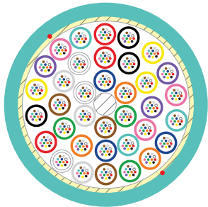
For fiber counts from 24-432

ADVENTUM cables are designed to be used in plenum rated environments. ADVENTUM supports the latest Gigabit Communications Protocols, including Gigabit Ethernet and ATM. This cable design employs dry waterblocking technology that utilizes super absorbent polymers to replace the messy gel filler inside the fiber tubes. Recommended installation procedures per ANSI/TIA-758, customer-owned outside plant telecommunications infrastructure standard. They are suitable for railway and mass transit infrastructure in tunnels, as well as for tray installations in industrial environments.